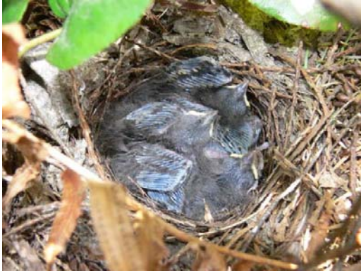
(Spotted Towhee Nest)