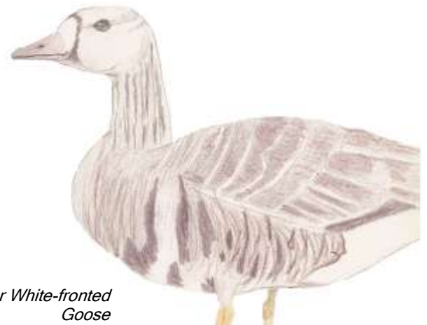
Greater White-fronted Goose