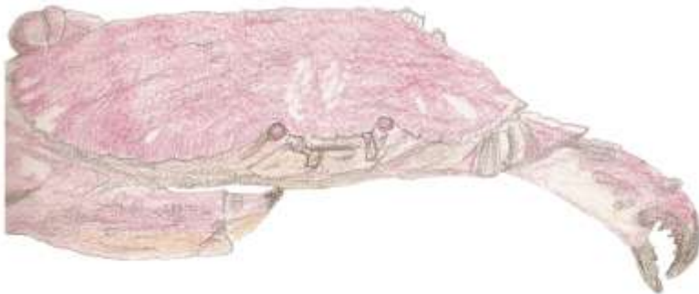
Red rock Crab