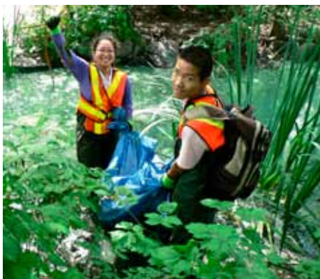
SPIRYT members remove yellow flag iris from the shorelines of Lost Lagoon.

Have some extra time this summer? Looking for a great place to volunteer with a fun group of people? Interested in learning new skills and helping with an important cause? Volunteer for SPES's Summer Youth Ecology Program / aka SPIRYT.