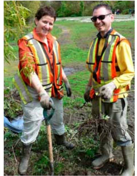
Community volunteers remove Himalayan blackberry, a common invasive species of riparian areas.

SPES's tree ivy management program has recently reached its first full year of activity, with its goal of slowing the spread of this invasive species and conserving the park's native plant species. Over the year, a total of 1,500 native shrubs and trees have been cleared of ivy, much of this effort resulting in the conservation of mature specimens.