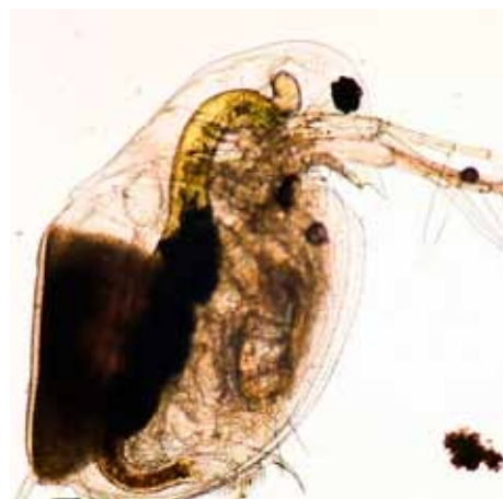
Tiny planktonic creatures such as this Daphnia form the basis of aquatic food webs and can be used as water quality indicators

On May 3rd, the VPB commissioners unanimously approved the report for information and at a subsequent planning meeting, the Park staff were asked by the Board to return in the fall with recommendations for potential actions.