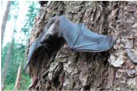
The first and only silver-haired bat ever discovered in Stanley Park was found near South Creek Trail in Spring 2010.

Every now and then you accidentally stumble upon something amazing! In this case that something was a male silver-haired bat ( Lasiorycteris noctivagans ) which was recently discovered by a staff member of the Stanley Park Ecology Society while exploring near South Creek Trail.