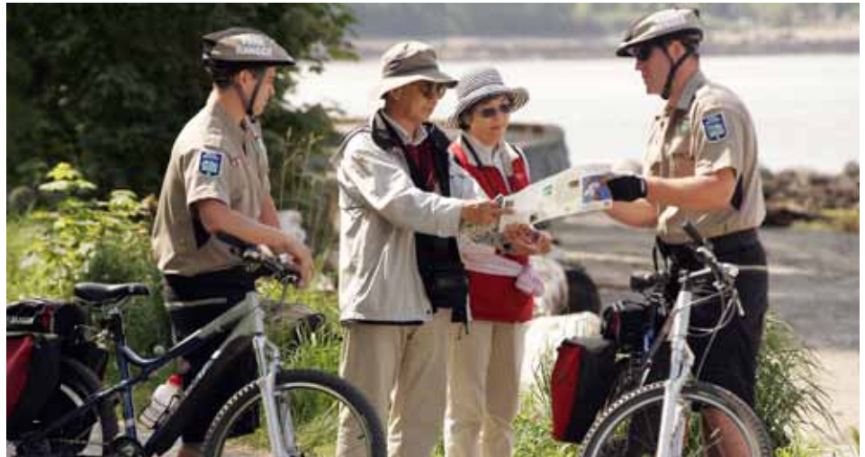
Park Rangers patrol Stanley Park from the May long weekend to September's Labour Day

In recent years, SPES and the Park Ranger program have been collaborating with the intention of strengthening communication and information-sharing between the two organizations.