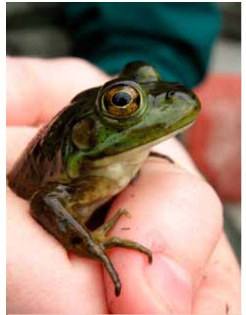
Introduced green frogs and bullfrogs in Beaver Lake may have a role to play in the disappearance of our native amphibian species.

Another finding highlighted in the report which received attention upon its release is the decline in native biodiversity. There were six environmental indicators used to describe this component of ecological integrity, all of which were rated as either 'poor', 'cause for concern' or could not be rated due to lack of information. The overall rating for native biodiversity is 'cause for concern' mainly because -- although there is still a large diversity of animals living in and using the Park -- there has been a decline in recent years, especially in reptile and amphibian species. Recent SPES surveys and the observations of local naturalists both confirm that once common species such as native turtles, tree frogs and garter snakes are no longer observed in the Park. Although the report does not